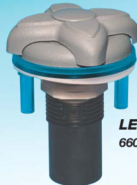
LED AIR CONTROL 660-3500L