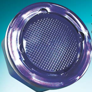
5" LED JUMBO SPA LIGHT 630-K008