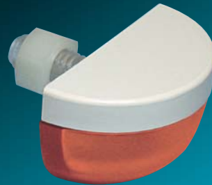
LED ACCENT SCONCE LIGHT 660-6300