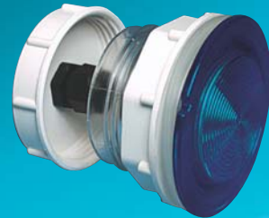
3 1/2" LED STANDARD SPA LIGHT 630-5008