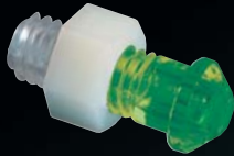
1/2" LED FACETED LIGHT 633-7078