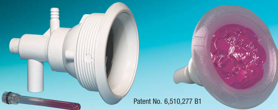
Patent No. 6,510,277 B1

Add an "L" onto the end of any Mini, Poly or Power Storm Jet Body part number to make a lighted jet body of your choice.