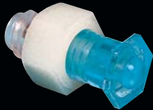
1/2" LED HEX LIGHT 633-7088