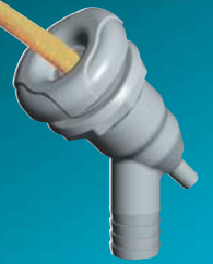
Patent No. 6,510,277 B1 Patent Pending.