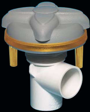
1" LED ON/OFF VALVE ● 1" On/Off turn valve, single port. 600-3520L