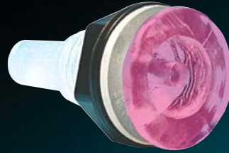
1" LED FACETED LIGHT 633-7098