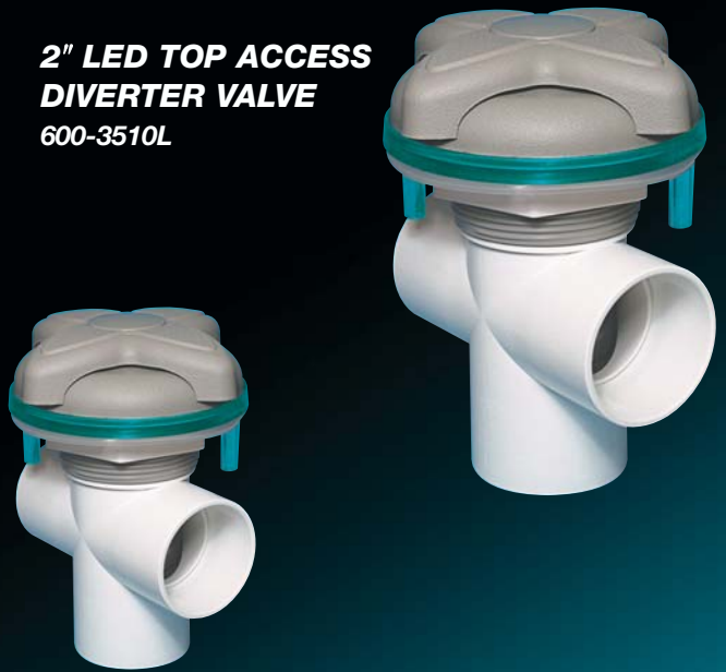
2" LED TOP ACCESS DIVERTER VALVE 600-3510L