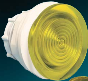
2 1/8" LED SPA LIGHT 630-0008